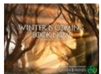
Tourism Ireland's Game of Thrones social media campaign

Northern Ireland Screen markets the benefits of Northern Ireland as a centre for independent film, television and digital content production to the global screen industries; promotes its product and talent and communicates its success stories; provides practical and financial support for distribution, sales, marketing and PR for the Northern Ireland sector including trade missions to industry markets, conferences and festivals.