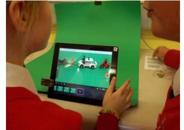
Nerve Centre Workshop

Northern Ireland Screen works in partnership with and provides funding from DCAL for Northern Ireland's three Creative Learning Centres (CLCs); the Nerve Centre in Derry/Londonderry, Nerve Belfast and the Southern Education and Library Board's AmmA Centre in Armagh, to enable the centres to offer a range of integrated creative digital technology skills programmes for teachers, youth and community leaders and young people to build sustainability in schools and the youth sector. A key element of the service provides professional development programmes for teachers and youth leaders. The Education and Training Inspectorate evaluation reports of the CLCs have demonstrated the valuable contribution they make in supporting schools and the NI curriculum.