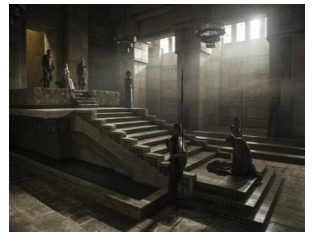
Game of Thrones in Titanic Studios

The two new sound stages, built adjacent to the Paint Hall in Titanic Quarter, opened in 2012. These, together with the Linen Mill Studios in Banbridge, means Northern Ireland Screen can now boast in excess of 180,000 sq ft of studio space. Northern Ireland Screen markets these facilities to the global industry. We are actively seeking to encourage the development of further studio space within Northern Ireland.