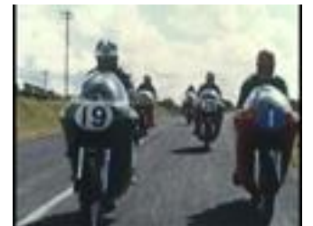
Digital Film Archive

Launched in November 2000 as part of the British Film Institute's (BFI) Millennium Project, Northern Ireland Screen's Digital Film Archive (DFA) is a free public access resource containing over 70 hours of film footage spanning 100 years of Northern Irish history from 1897 to 2000. Items in the archive include drama, animation, documentaries, news, newsreels, war-time propaganda, amateur and actuality films. The DFA is used by teachers, students, historians, tourists and anyone with a keen interest in moving images. The DFA can be accessed at 22 sites across Northern Ireland including museums, arts centres and public libraries.