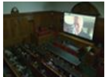
BFF screening at Belfast High Courts

Northern Ireland Screen seeks to provide all the people of Northern Ireland with the opportunity to see as wide a range of films as possible, including those made by the wealth of home-grown creative talent. We want specialist exhibitors and festivals in Northern Ireland to make a significant contribution to film culture, and play an increasingly important part in the overall distribution landscape. In line with DCAL priorities, emphasis is placed on targeting areas of poverty and social deprivation as well as increased outreach activity, spearheaded through Film Hub.