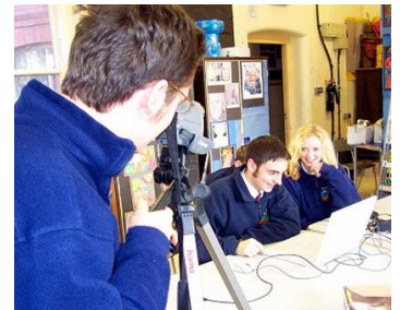
Moving Image Arts pupils

Northern Ireland Screen works in partnership with the Council for the Curriculum, Examinations and Assessment (CCEA) and Northern Ireland's three Creative Learning Centres on the continuing development of Moving Image Arts (MIA), the first A-Level in the UK in digital film-making. In 2014 over 1,600 candidates were entered for the MIA qualification at 80 A-level centres and over 45 GCSE centres. Further increases in the number of schools offering the newly revised qualification at GCSE is anticipated in 2015.